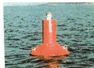
Temporary buoy Qk, Fl, R 052° 42, 768N 004° 03, 676W

There has been much concern from the sailing fraternity of the Club regarding the loss of the Perch marker and it's replacement by a temporary buoy and many